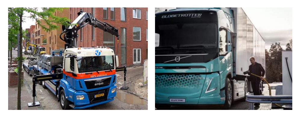
Figure 2-3 Examples of N3 category electric vehicles.

The battery packs and outputs in this category are significantly larger than those of passenger EVs. Depending on the charging scenario, this type of vehicle will mainly be charged using DC charging infrastructure with capacities between 50 and 350 kW. A global standard is under development [14] for achieving higher charging capacities between 1 and 4.5 MW. These outputs will be especially useful for inter-urban and rural freight traffic over longer distances, where vehicles need to be recharged quickly en route. ElaadNL expects the first of these charging facilities to be operational between 2025 and 2030 [9].