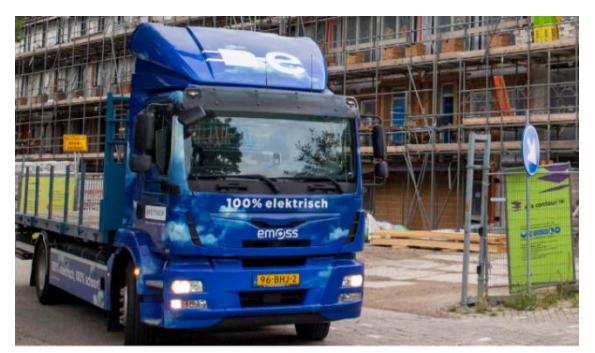
Figure 2-2 Examples of N2 category electric vehicles.

The battery packs (kWh) and outputs (kW) in this category are typically larger than those of passenger EVs. Depending on the charging scenario and the size of the vehicle, charging takes place via AC or DC charging infrastructure.