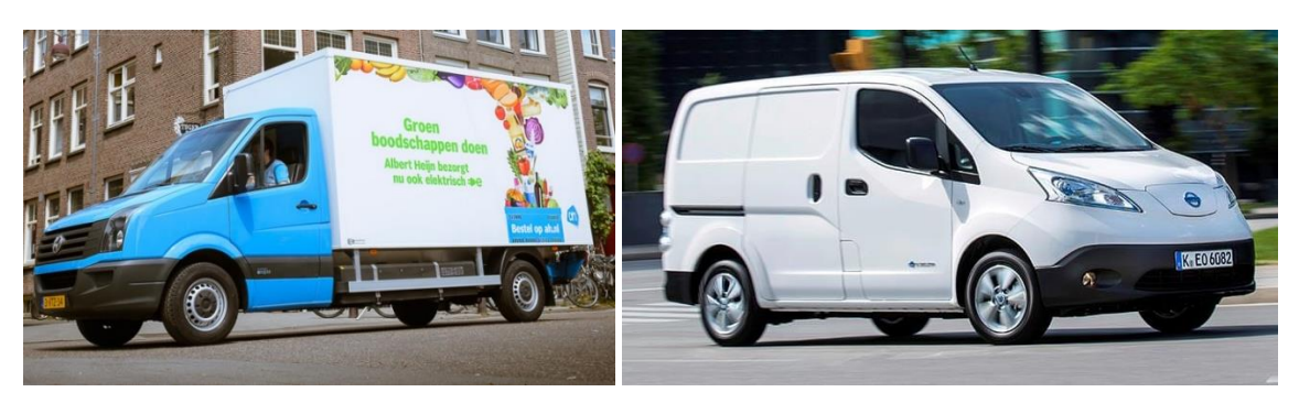
Figure 2-1 Examples of N1 category electric vehicles. Source: Albert Heijn (left), Nissan (right).